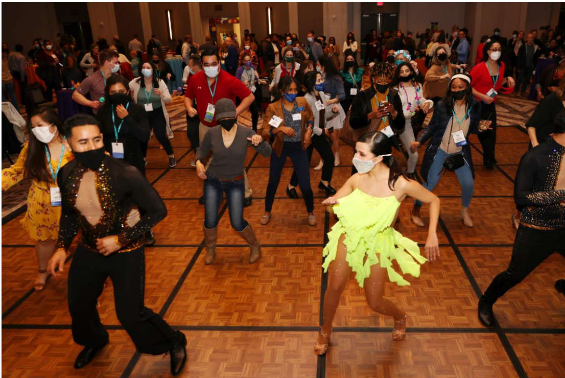
Attendees dance at the APTA Celebration of Diversity on Feb. 3, 2022, in San Antonio, Texas.