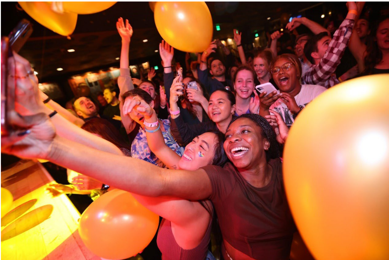
Attendees enjoy a balloon drop at the APTA Celebration of Diversity on Feb. 23, 2023, during APTA Combined Sections Meeting in San Diego, California.